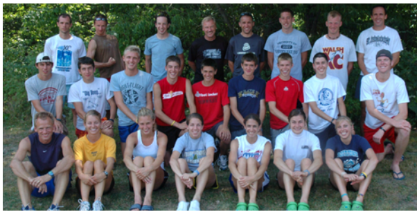
Above is the staff from the 2007 NE Ohio CC Camp. The staff for the 2008 NE Ohio CC Camp will include many of the same staff with some additions:

Email address requested if at all possible so that updates can be sent